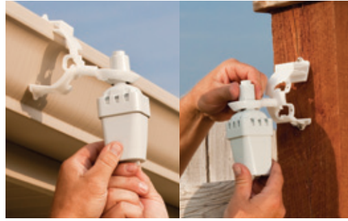
Versatile Mounting Bracket

The Rain Bird Rain or Rain / Freeze Sensor shall be manufactured by Rain Bird Corporation, Glendora, California.